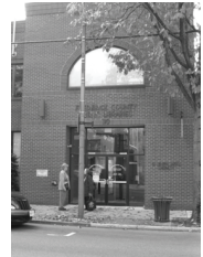
Literacy Council of Frederick County 110 E. Patrick St.

HOLIDAY BOOK DRIVE FOR NEEDY CHILDREN IS COMING SOON. CHECK OUR WEBSITE, FACE- BOOK, OR CALL US FOR DETAILS.