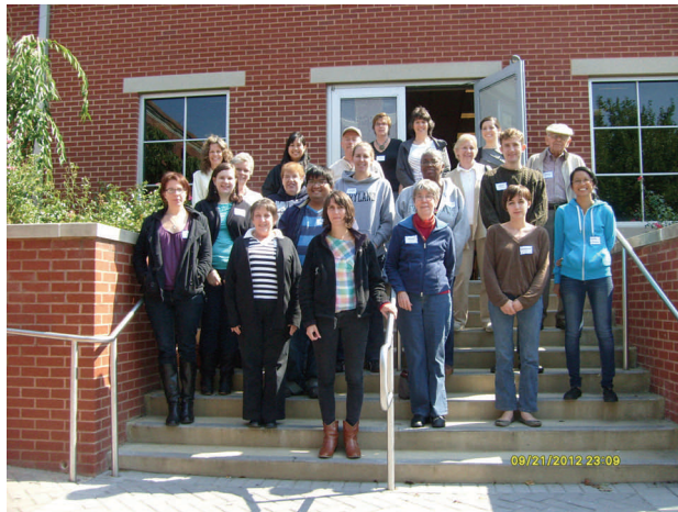
- Newly certified tutors in front of the Community Room at the C. Burr Artz Library